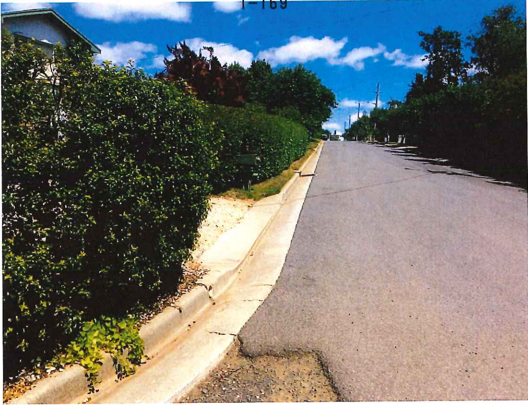
Hedge in naturestrip on southern side of Old Punt Rd which will need to be trimmed or removed to allow for construction of footpath.